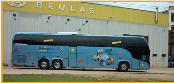
BUSES EURO VI