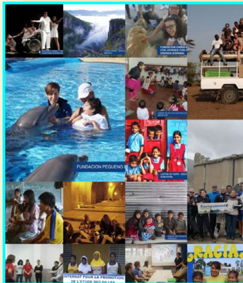
SOCIAL IMPACTS: INTERNATIONAL VOLUNTEER PROGRAM IN MIDDLE HIGH ATLAS MOROCCO