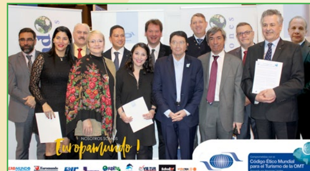
SIGNATURE OF THE UNWTO ETHICAL CODE 2017