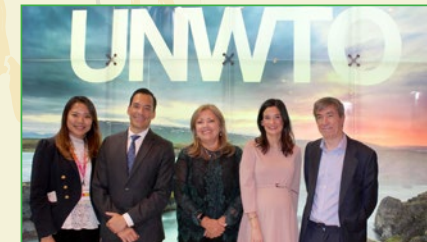
SIGNATURE OF THE UNWTO ETHICAL CODE 2018