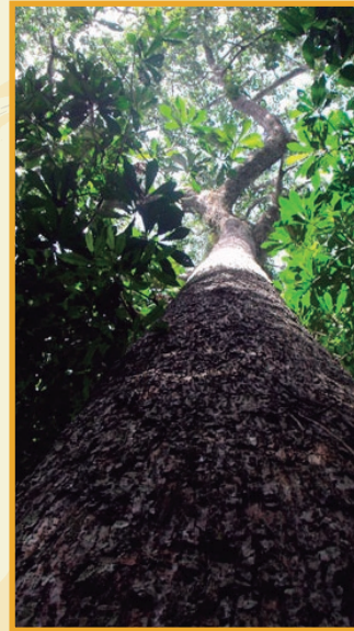
GREENHOUSE GASES EMISSIONS OFFSETTING