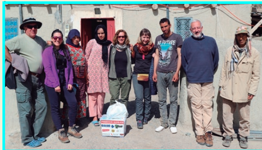
SOCIAL IMPACTS: FOUNDATION