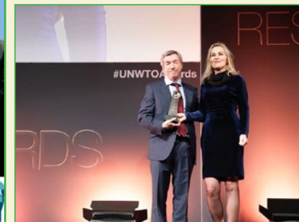
UNWTO ETHICS AWARD 2018